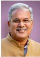
Shri Bhupesh Baghel